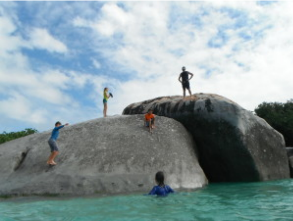
Jumping off the rock