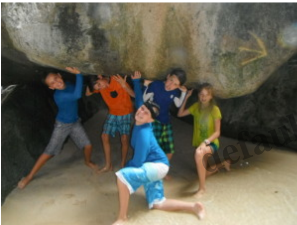
We are so strong!!