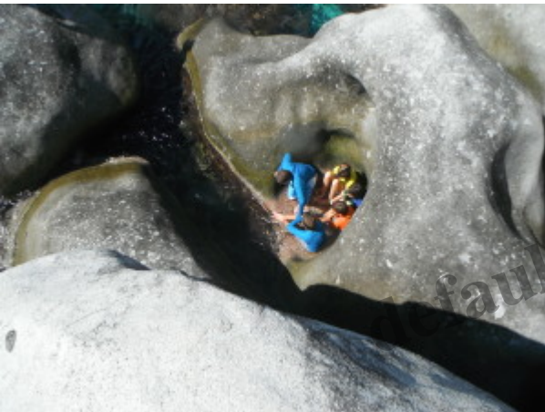
the little hole we found that fills with water