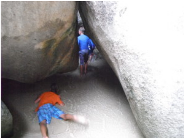
Climbing through the crack